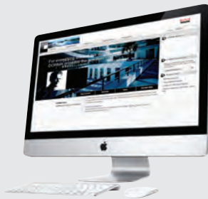
Data captured by DORVISION