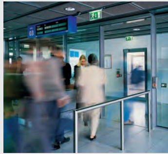
A fault with your door could lead to customer dissatisfaction and loss of revenue

DORVISION allows you to access this information through the internet. You can monitor the performance of the doors and determine footfall trends through the doors. With DORVISION you will always be ready for business.