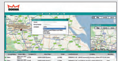
Fault diagnosed, door controlled remotely offering immediate response